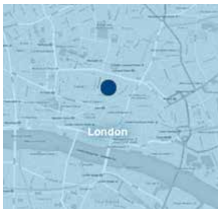
36 Broadway | London | SW1H 0BH